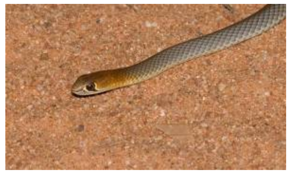
Demansia psammophis cupreiceps, Yellow-faced Whipsnake

Some of the creatures seen: