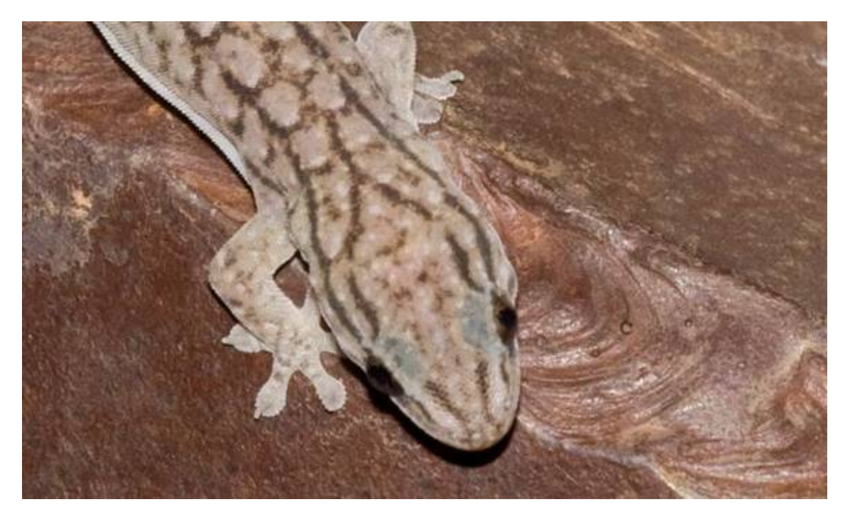
Gecko, Gehyra variegata