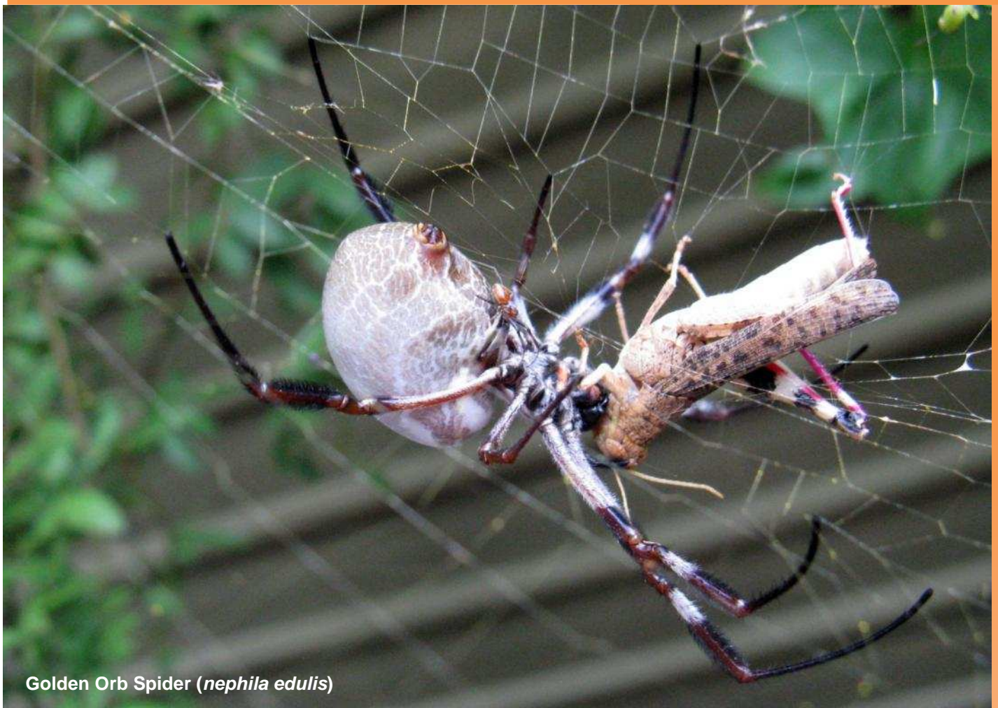
Golden Orb Spider ( nephila edulis )

Meetings are held on the second Wednesday of each month (except December & January) at 7:00 PM at Higher Education Building at Charles Darwin University. Visitors are welcome.