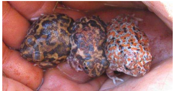
Two Trilling frogs and one Desert Spadefoot Toad

Third was the Tanami Toadlet, Uperoleia micromeles . The first ones of these at Newhaven were only found the previous day. They are rarely seen and not much is known about them. These don't grow as big as the other two species, only about 3 cm long, are light brown with some orange spots and with a wide snout and short limbs. The large parotid glands on the back of their necks have a gold edge.