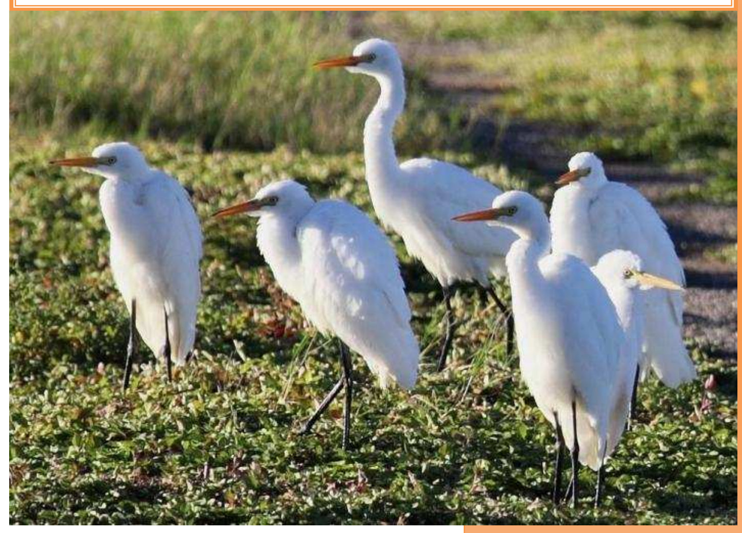
Cattle Egrets (Ardea ibis)- Part of a flock of eleven who dropped in at the sewage ponds early in April.

Meetings are held on the second Wednesday of each month (except December & January) at 7:00 PM at Higher Education Building at Charles Darwin University. Visitors are welcome