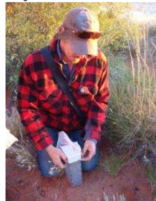
Preparing to remove animal from an Elliot

In the afternoon we headed off on one of the well documented routes called the "Lakes Drive" which included the very large and spectacular salt lake, Lake Bennett. There are many other smaller lakes as well with varying types of vegetation. All was beautiful and amazing.