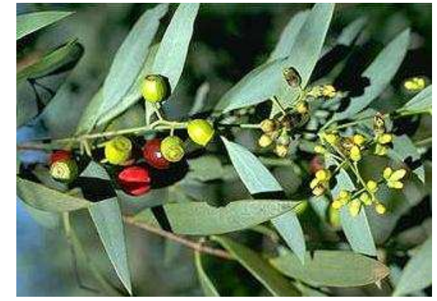
Bush plum - Santalum lanceolatum