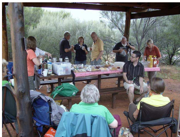
Christmas 2010 Desert Park

Hoping you can all come to the 2011 Christmas Party at OPBG, Sunday 4 Dec, 7.00 for walk, 8.00am for food.