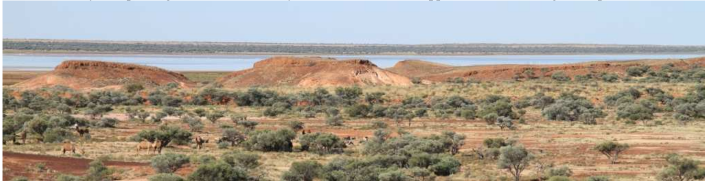
Mesas, camels and Lake Pulchera in the background