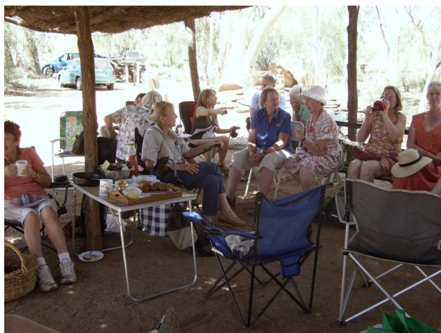
Christmas 2009 Pitchi Richi

THE FIELD NATURALISTS COMMITTEE WOULD LIKE TO WISH ALL A BLESSED CHRISTMAS AND A PROSPEROUS AND HAPPY NEW YEAR FOR 2012