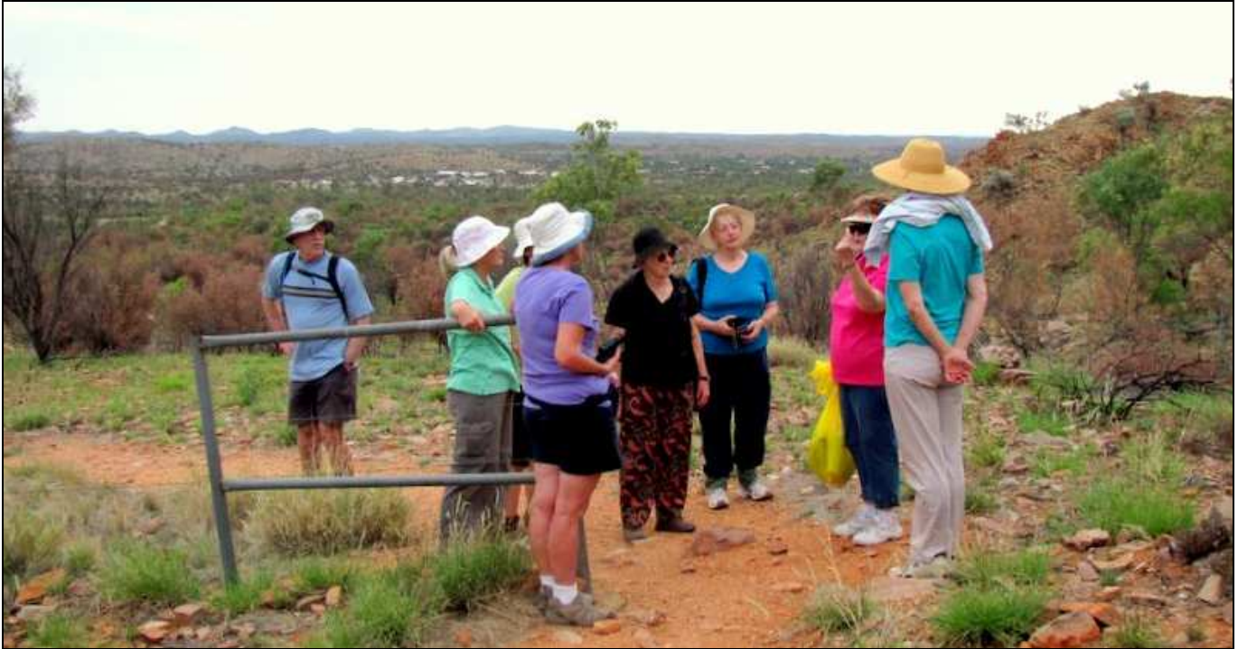
Even just to the fence, commanded a nice view of the valley