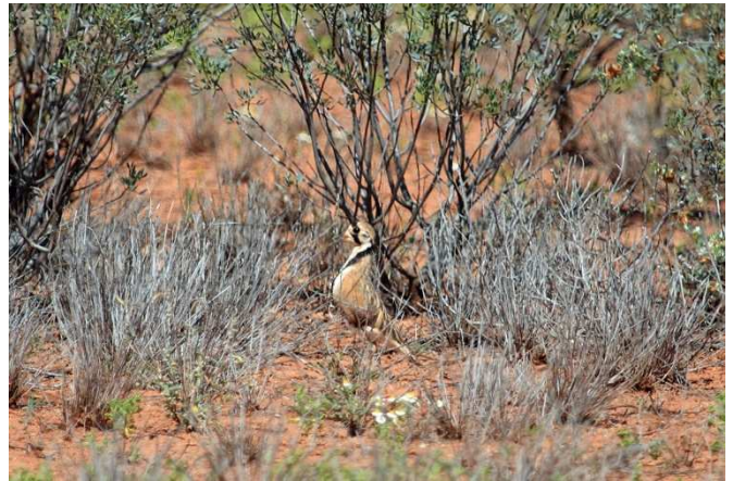
Inland Dotterel doing the camouflage thing.

Wonderful red dunes set against a carpet of flowers and being with a group with such wide knowledge and a preparedness to share this.