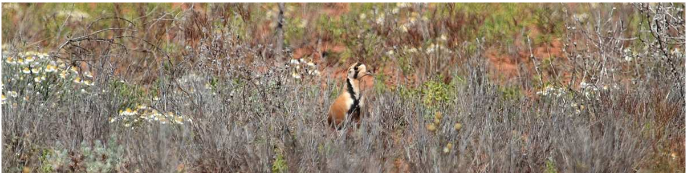
Inland Dotterel – can you see me now?