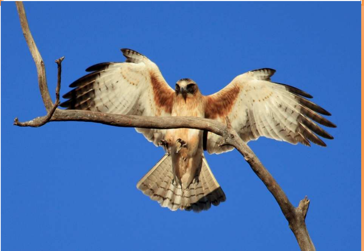
Little Eagle landing – Henbury Station.

Meetings are held on the second Wednesday of each month (except December & January) at 7:00 PM at Higher Education Building at Charles Darwin University. Visitors are welcome.