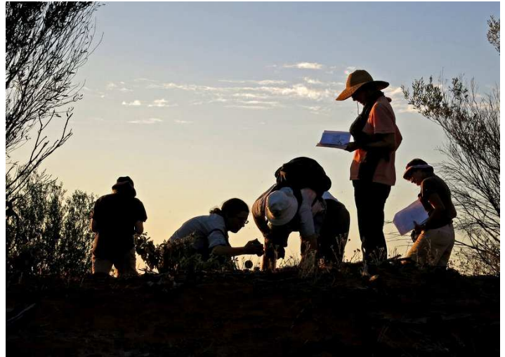
Field-testing the Santa Teresa Road Guide with the Field Nats; Stop #6.