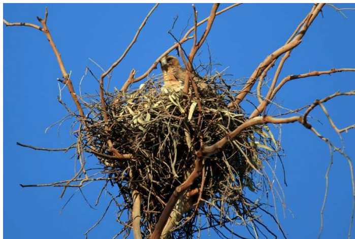
Little Eagle Nest

Next was Hart's Camp waterhole which we had visited last year. This water was much fresher with a good growth of Myriophyllum and a charophyte, Chara . These plants act as filters keeping the water clear. The Chara felt a bit gritty due to the encrustations of calcium carbonate. Sampling here for macro-invertebrates was more productive. Many dragonflies were hovering. With the microscope at home I identified the larvae of, yes, dragonflies and also damsel flies which hold their wings folded and at 45 degrees, compared to dragons who hold them out flat when at rest. Plenty of mosquito larvae, and midge larvae and pupae. There were many snails, two different sorts, pond snails and tiny flat ones from the families Lymnidae and Glacidorbidae respectively. Also a few seed shrimps and copepods. I only found one beetle Nectersoma a diving beetle. And though I did not find any caddis larvae which live in cases of sand or plant detritus there were gelatinous blobs holding caddis fly eggs. Previous surveys (not by me) have found prawns and yabbies, and more beetles. Joan's algae sampling showed quite a variety including four different filamentous algae and many diatoms. With Jim's help I corralled a few fish, small, so hard to tell what they were, maybe Finke River Hardyheads. So a different and more prolific array of life here than that found in Snake Waterhole.