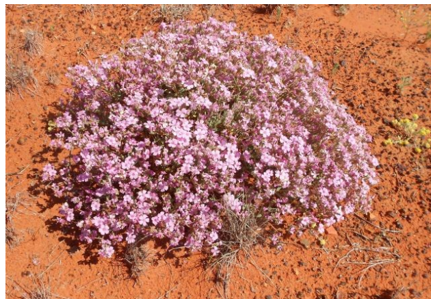
Frankenia serpyllifolia or Bristly Sea-heath

Despite being a very hot weekend and the flies being exceptionally friendly, it was nevertheless a not to be missed trip. The wildflowers were “a vision splendid”! My pick for the weekend is the Bristly Sea-heath ( Frankenia serpyllifolia ). Our very first stop after leaving the homestead was on an open plain with sparse Eremophila species and other shrubs but the dominant ground cover was bristly sea-heath. This is a low-growing densely branched perennial shrub with numerous brittle branches covered in bristles (hence the common name). Flowers are clustered and consist of 5 pink petals. Found in saline areas, heavy clay soils or sandy soils overlying clay. I think the latter best describes where we stopped. It continued to pop up every now and again in our travels throughout the weekend.