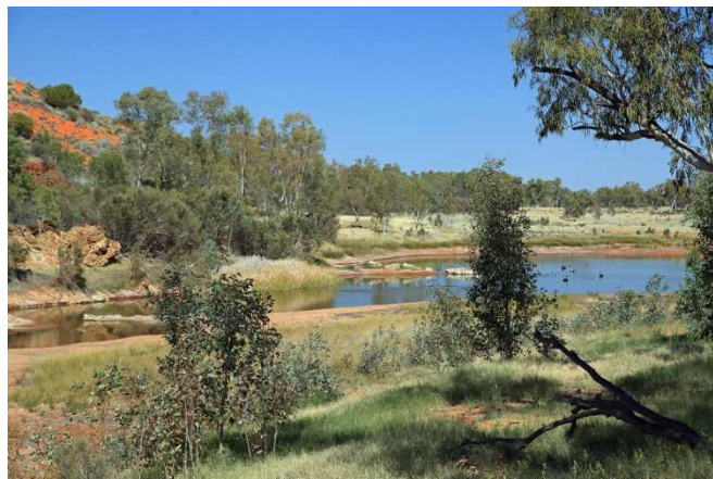
Snake Hole and Black Swans.