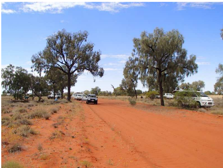
Seeking shade at lunch time.

The fields of colour, yellow billy buttons and other yellow, and white daisies, white native stock, pink Parakeelya , covering the red sands was spectacular. And the myriad of different plants when we stopped to get out of the cars and search the ground, notably the mounds of pink Frankenia serpyllifolia and the unusual Tecticornia triandra , green and fleshy. Astonishment at the thick vegetation covering the swamp beside our campsite. Very strange, having previously seen it full of water, now you can walk over its rough red clayey surface with large clumps of spreading vegetation mostly mat plants of the genera, Bergia and Glinus , and the perfumed Stemodia . From the meandering depression through the lake bed, you could imagine the path of the water which fills the network of pools and then recedes as the lakes dry. Delicious and welcome tea provided by Anne Pye. Over-population of flies.