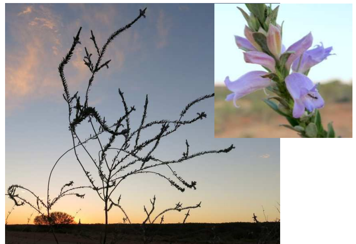
Eremophila christopheri ; Stop #7.