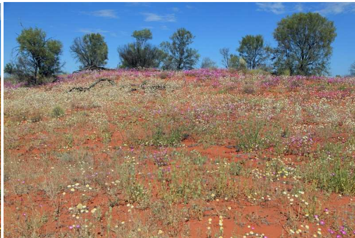
top - Frankenia serpyllifolia ; below left – Button Daisies & Parakeelya; below right – Everlastings and Parakeelya