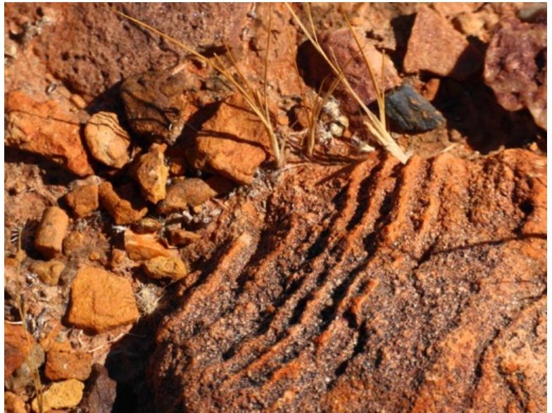
Cruziana trilobite trails Stairway Sandstone

During a break in the drawing class, I was a little shocked to find Anusuya Chinsamy-Turan and some mega-bird loving cronies drilling into dromornithid bones in a back room at the Palaeo Lab. However I was forced to acknowledge the value of her work when she talked about bone histology (microscopic structure), showing in stunning microscopic detail, the growth rings in bones she works with. This creates an intimate window into the lives of extinct animals with information about growth rates, gender, disease and, sometimes, environmental conditions.