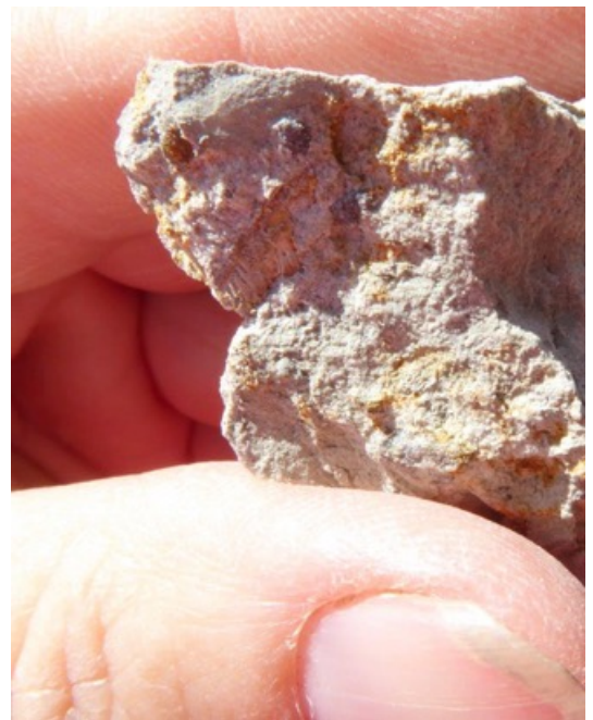
Mount Maloney Stairway Sandstone Silt bed Tantalepis

These tiny fossils contrasted with a jumbled mess of (probably late) Oligocene bones (23 plus million years old) which brought Alcoota to mind- and not just because of the tangled mishmash of pieces, but because the bones belonged to crocodiles, giant dromornithid birds and other familiar megafauna. Here we found a couple of recognisable fossils- a bird phalanx (toe bone) and a shiny black tooth from Baru , the mega-crocodile.