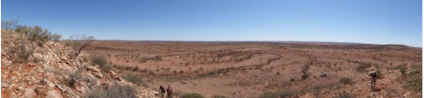
View from Mt. Watt

The NT Museum hosted the 15th Conference on Australasian Vertebrate Evolution, Palaeontology and Systematics (CAVEPS) in Alice Springs from the 1st to 15 th September