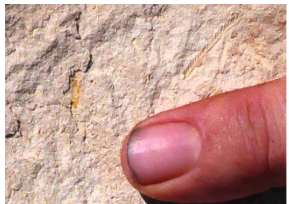
Stairway Sandstone Arandaspis scale