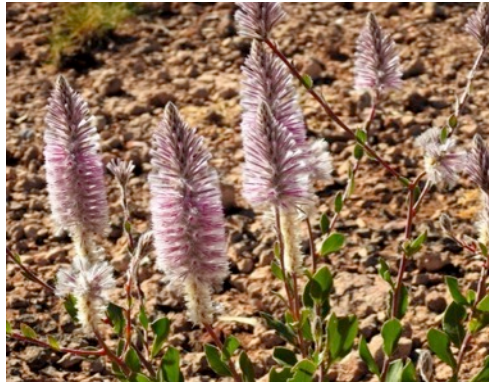
Ptilotus exaltatus – Leigh Woolcock