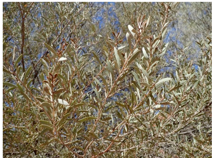
The leaves of the Acacia aneura var. major are 18-53 mm long and 4.4-8 mm wide.