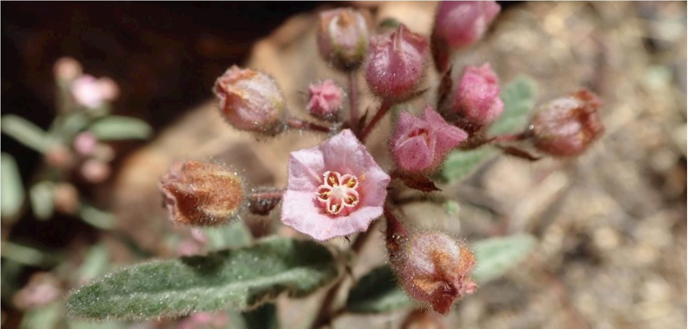
The bushes, some up to 4m high, were covered in delicate pink flowers set off by the hairy grey-green leaves.