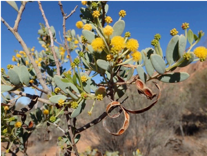
Many bushes of Acacia bivenosa were displaying their golden flowers along the roadside on the trip out.

A few friends took the 70km trip out to N'Dhala Gorge a few days ago. The trip was mainly to see the Commersonia magniflora , previously called Rulingia magniflora , flowering. It was stunning and well worth the trip. The gorge was burnt a few years ago. There is lots of Buffel Grass, but lots of little native plants are hanging on in spite of it, as were a few young Acacia undoolyana .