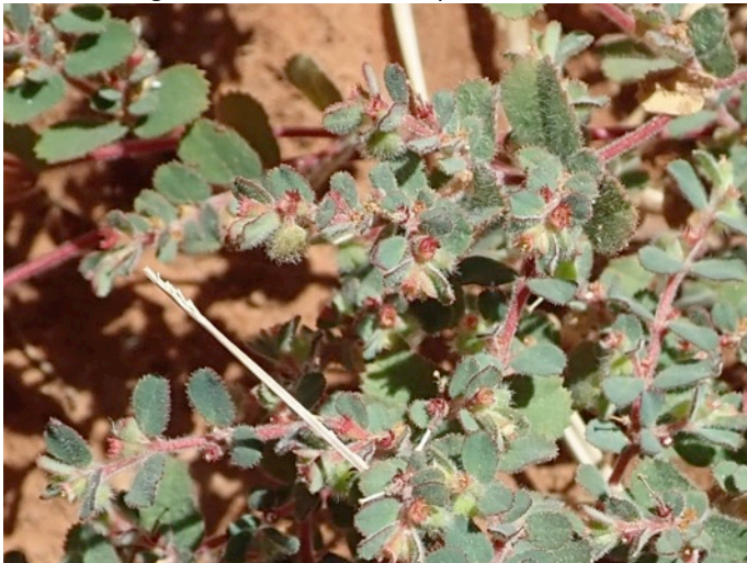
Euphorbia centralis , this tiny Euphorbia was surviving the Buffel by being right on the edge of the path into the gorge.