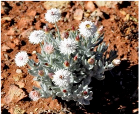
Anemocarpa saxatilis – Leigh Woolcock