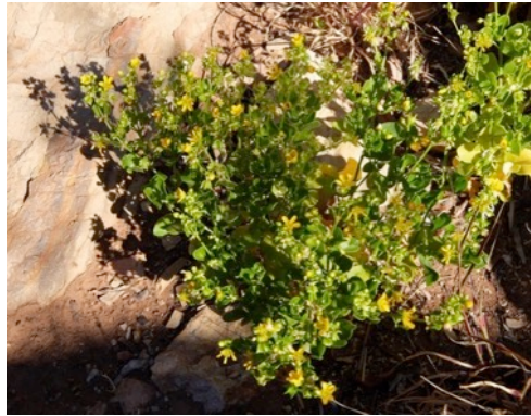
Zygophyllum apiculatum