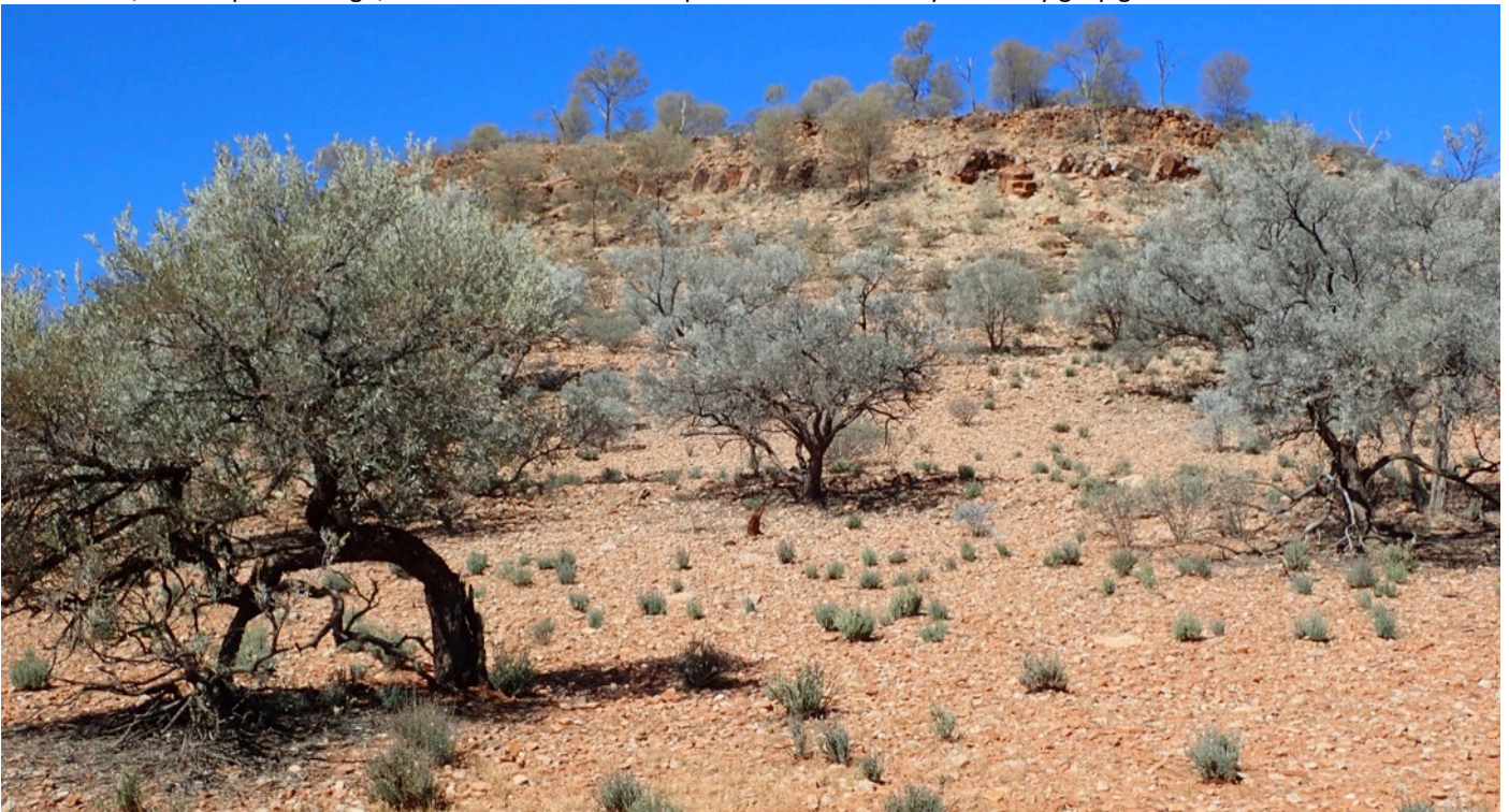
Leaving N'Dhala Gorge along the Binns Track, we saw several stands of Acacia georginae with Ptilotus whitei scattered beneath.