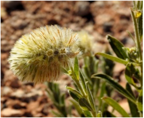
Ptilotus clementii – Leigh Woolcock