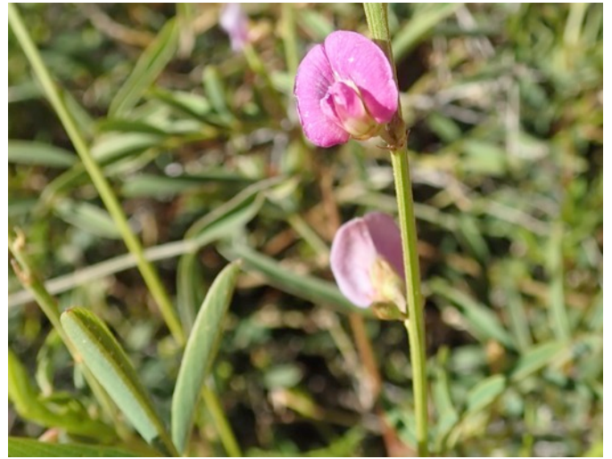
Tephrosia supina , one of the small native plants trying to grow through the Buffel Grass.