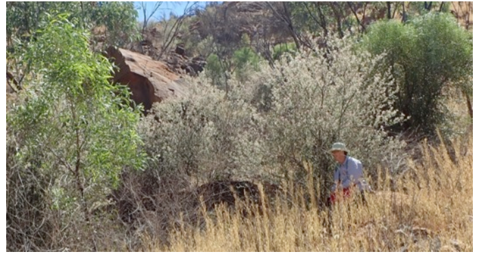
The Commersonia magniflora bushes were in a gully to the right of the main path opposite a cave.