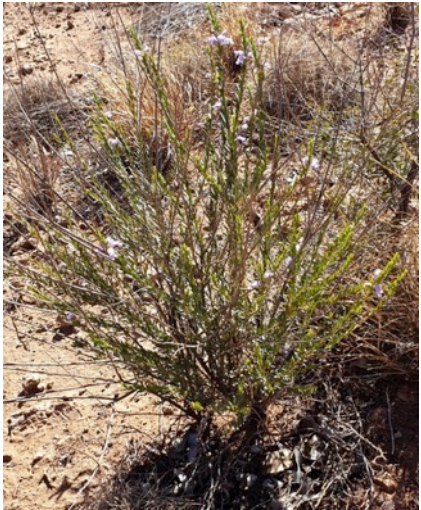
Eremophila christophori - Liz Moore

Of most interest to me, flora wise, was coming across a limestone/dolomite outcrop with a host of plant species. The first to catch my attention was Limestone Pussycats Tails ( Ptilotus clementii ) with its distinctive nodding flowerheads. Most of our trekkers thought the nodding head was due to the plant being past its best but, not so, as this is a distinctive feature of this species. Hill Sunray ( Anemocarpa saxatilis ), a small, round, woody, woolly perennial herb with daisy-like flowers, also thrives in this type of rocky ground. The species name saxatilis is latin for rocky, alluding to where it is found. Two other Ptilotus – Smoke Bush ( Ptilotus obovatus ) and Crimson Foxtail ( Ptilotus sessilifolius ) were also noted in the area with the latter just off the rocky outcrop. Further along but still on limestone was Hill Umbrella Bush ( Acacia bivenosa ) – a usual suspect in limestone. The species name refers to the two veins in the phyllodes (leaf adaptation) although this is not always distinguishable. My determination of the species (there are similar species) is because of where it is growing. A little further along the track was Dolomite Fuchsia ( Eremophila christophori ) in flower – my favourite Eremophila . Why – because of the history I have with this species. It was one of the first locally collected Eremophilas that I propagated and planted in my garden in the very early 80's.