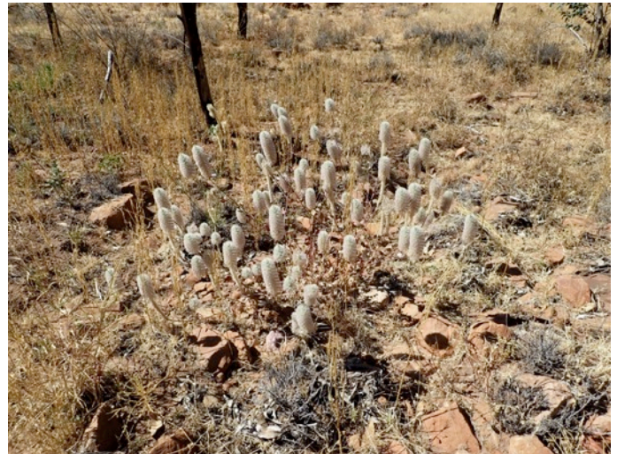
Ptilotus nobilis , made a beautiful candelabra display on a rocky area.