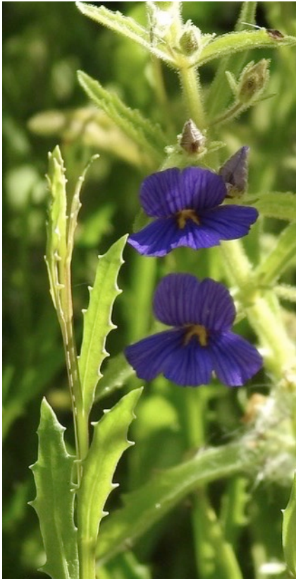
Stemodia viscosa – Leigh Woolcock