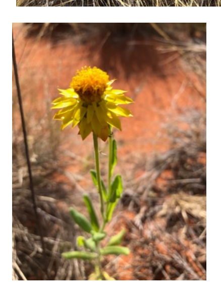
Smaller wildflowers such as this Xerochrysum bracheatum grow close to the walking track at Kuyunba, perhaps thanks to great efforts with buffel grass control