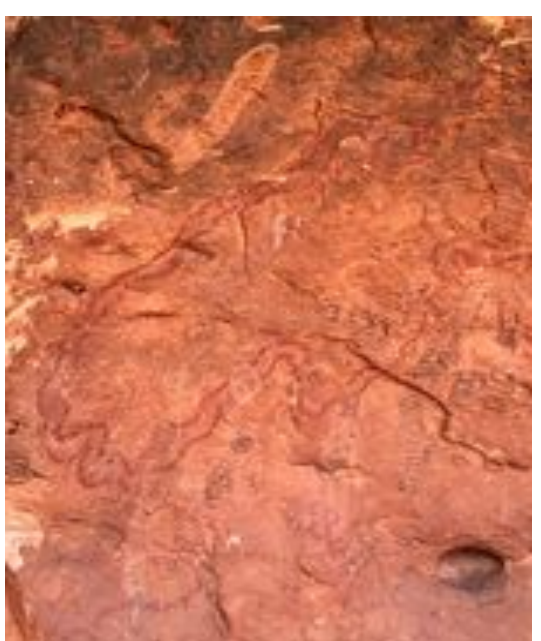
Rock art site, this one is accessible to all visitors and now under protective management