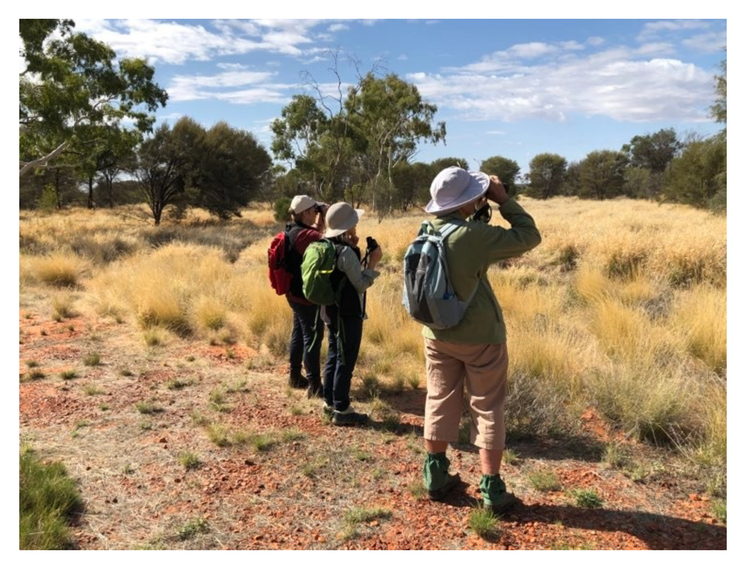
Bird watching at Kuyunba Conservation Reserve