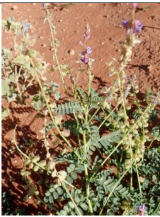
Swainsona burkei (Hairy Darling Pea) A prostrate, hairy herb, named after Robert O'Hara Burke. It has woolly, oblong pods with a furrowed suture line.

A sprawling or prostrate herb with mauve or white flowers and small inflated pods. It grows at the Ilparpa claypans.