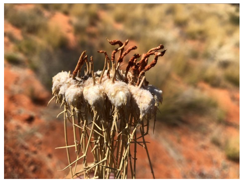
Woolybutt grass, Eragrostis eriopoda was a strong feature in the understory.