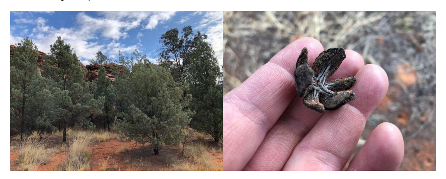
Callitris glaucophylla – adults and empty seed capsule